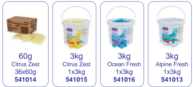
60g Citrus Zest 36x60g 541014